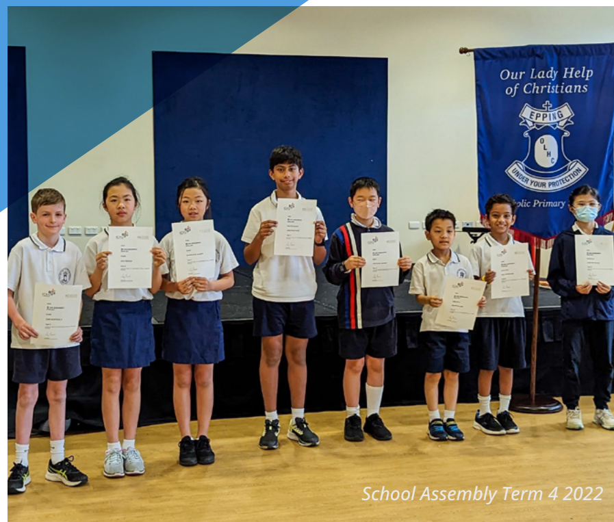
School Assembly Term 4 2022